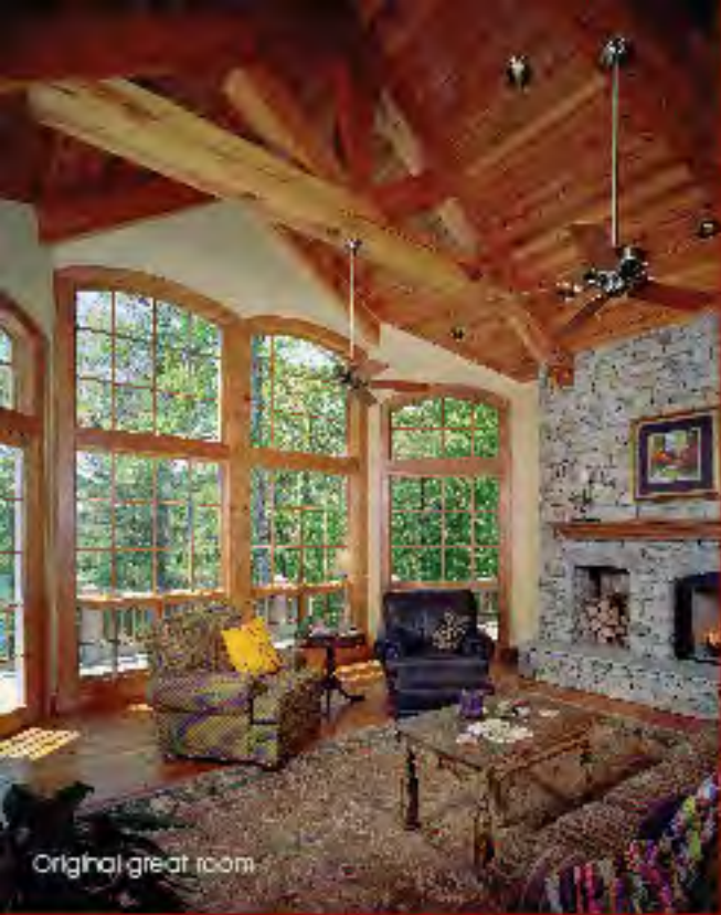
Original great room.