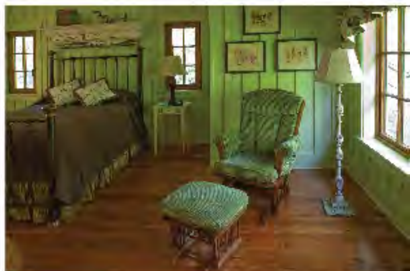
Board and batten walls in an inviting shade of green and glowing heart pine floors make the guest suite a cozy retreat from the hustle and bustle of the main house.

Soft green board-and-batten walls awash with filtered light and glowing heart pine floors provide a tranquil and quiet backdrop for children and guests to retreat from the bustling activities of the main house. The carriage house offers plenty of room to daydream on a cozy window seat, relax in a comfortable chair, or indulge in a warm bath in the suite's oversized claw-footed tub.