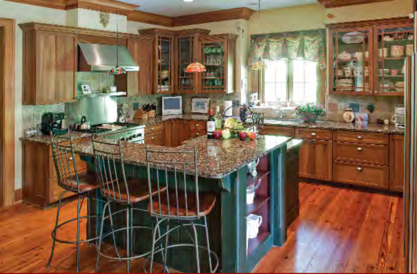
New mahogany-clad windows blend beautifully with custom cabinetry and enhance the overall design of this kitchen.

Partnering again with Morgan-Keefe enabled the Lake Keowee couple to take a home they already loved and make it even better. It was equally rewarding for Morgan-Keefe.