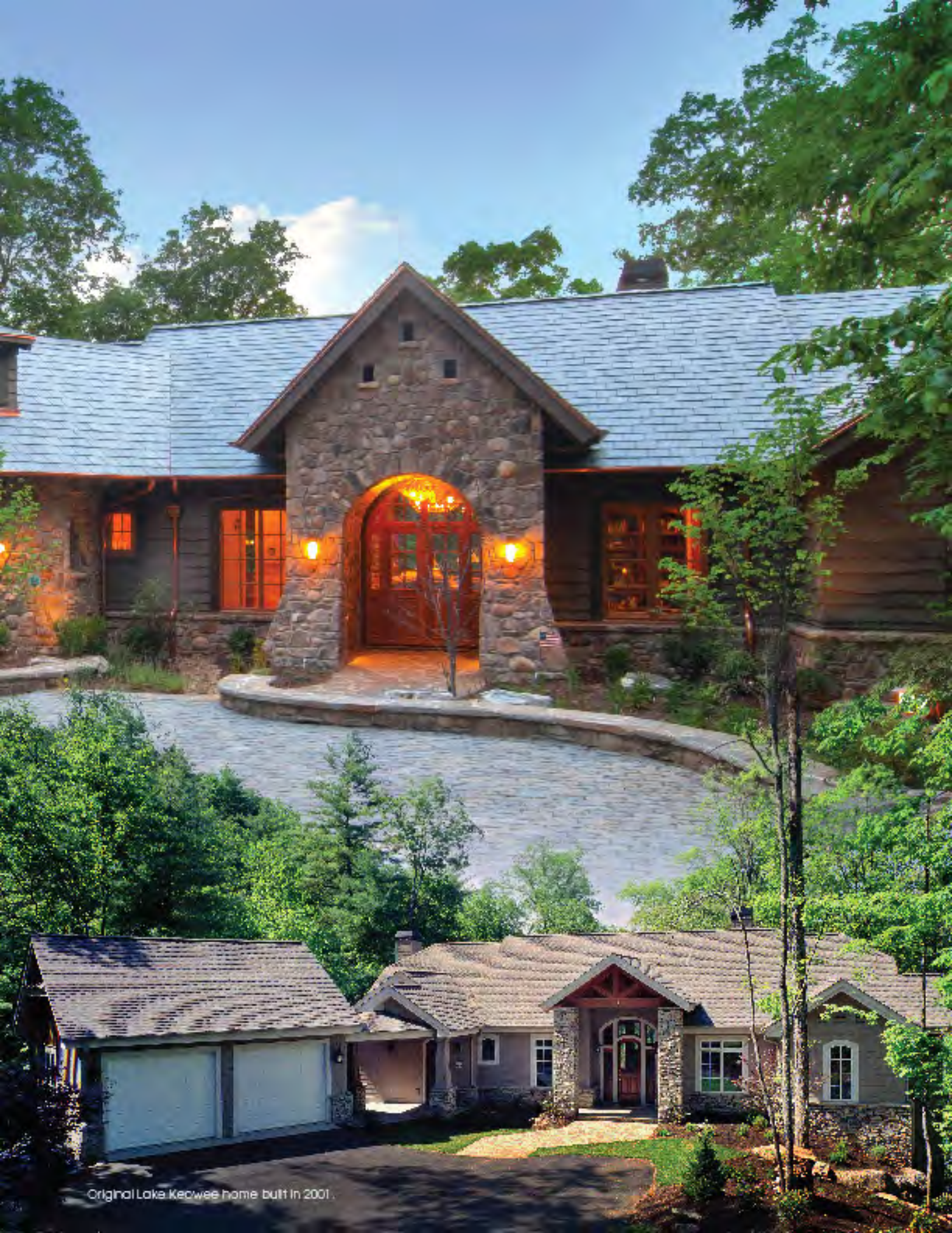
Original Loka Kewee home built in 2001.