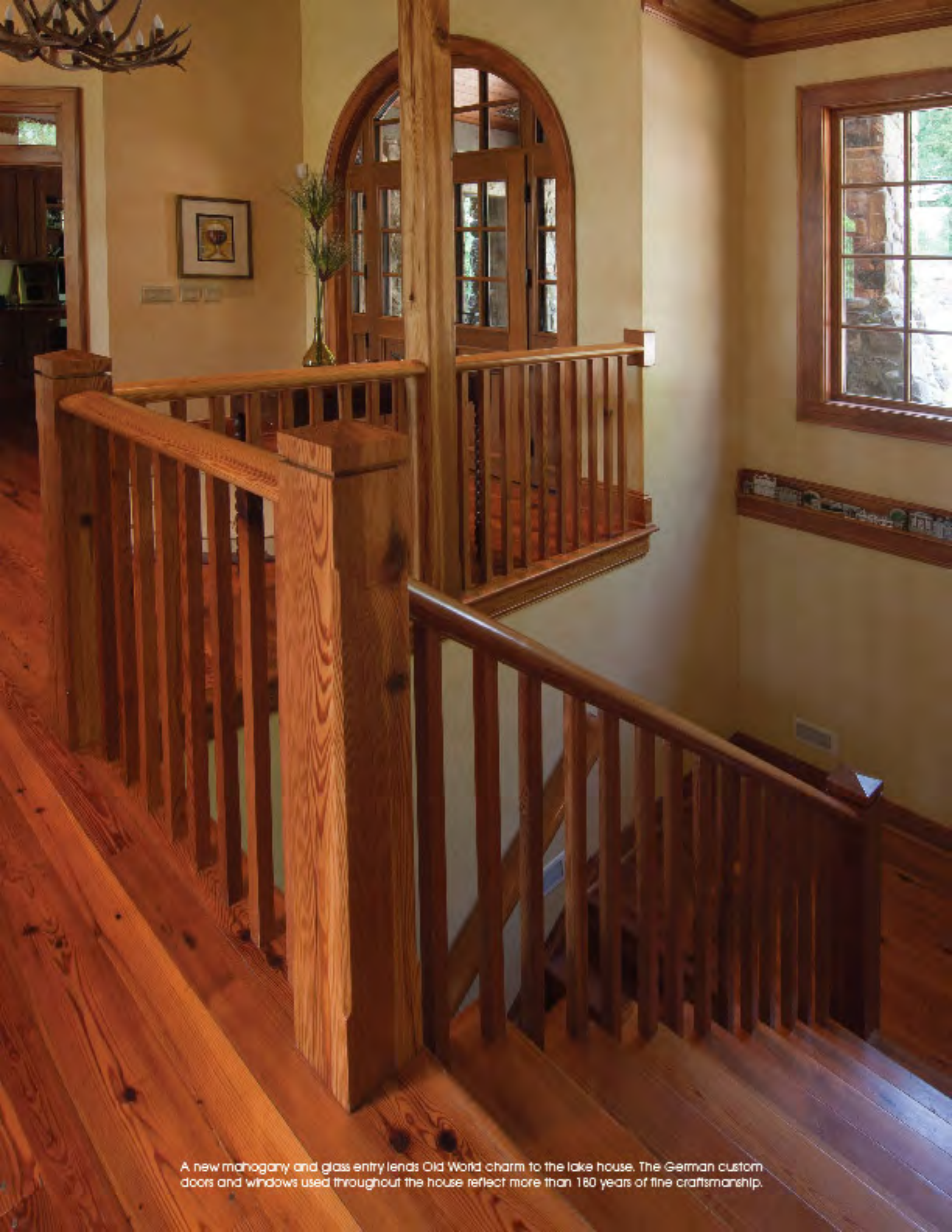
A new mahogany and glass entry lends Old World charm to the lake house. The German custom doors and windows used throughout the house reflect more than 180 years of fine craftsmanship.